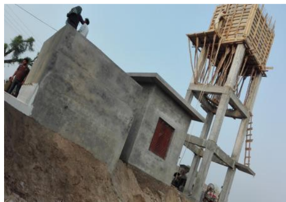
Construction in progress: SP-DWSS Haidari Pull