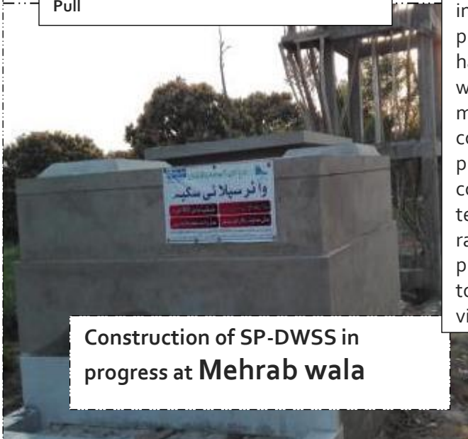
Construction of SP-DWSS in progress at Mehrab wala