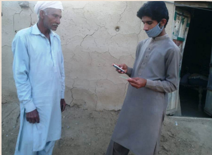
Mojaz Foundation field team helping in registration

Mojaz Foundation supported poor households to get registered on GoP portal for receiving support.