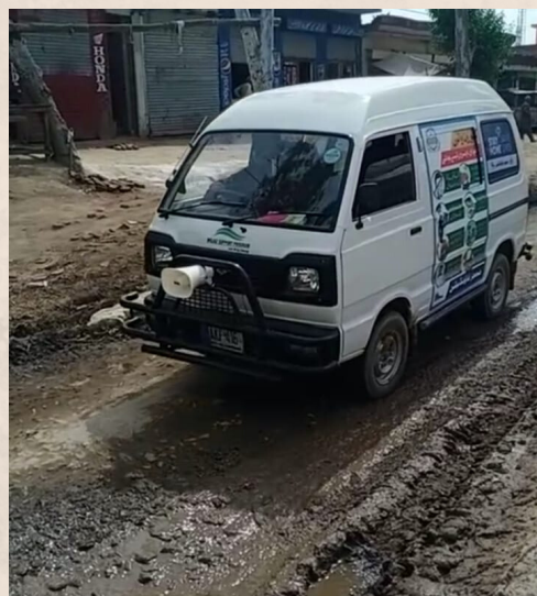
Awareness Raising Van of Mojaz Foundation in Narowal

Mojaz Foundation conducted meetings with the district governments in muzaffargarh, Bahawalnagar, Faisalabad and Narowal for the initiation of relief activities.