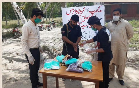
Awareness Raising and kit distribution session in Bahawalnagar

MF's first response to Covid-19 was based on government's guidelines for maintaining social distance. Our staff was advised to work from home. Only the few who were considered important to attend the office were allowed, generally the admin staff. The staff was in particular advised to keep contact with their colleagues via whatsapp, zoom and skype. Those who were involved in field activities were also stopped from going to the field and were advised to divert their focus towards documentation and creating whatsapp groups with the district government, other NGOs and with their activists, volunteers and VO members for sharing necessary updates.