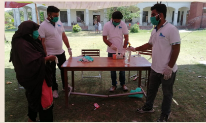
Our Volunteers at EHSAS Cash Counter - Bahawalnagar