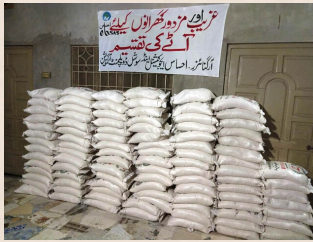
Flour Distribution at Bahawalnagar