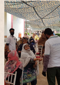
EHSAS Cash counter at Faisalabad