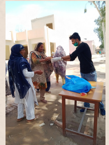
EHSAS Cash counter at Bahawalnagar