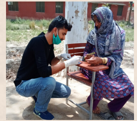
Registration in EHSAS Cash Grant