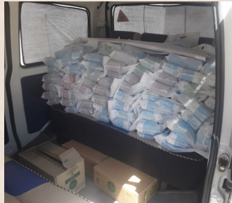
First batch of Hygiene Kits provided by HUBCO CSR funds.