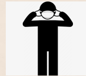
Using a Mask