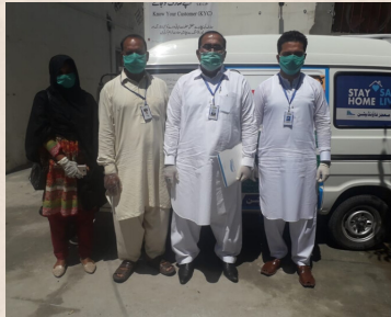
Mojaz Foundation's Narowal team on its route to distribute the first batch of kits.