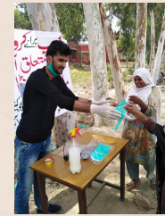
Our Volunteers at EHSAS Cash Counter - Bahawalnagar