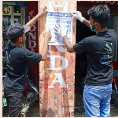
Awareness Pamphlets at Bahawalnagar