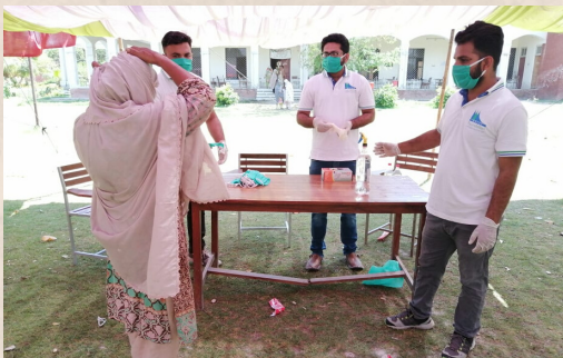
Awareness Raising and kit distribution session in Muzaffargarh