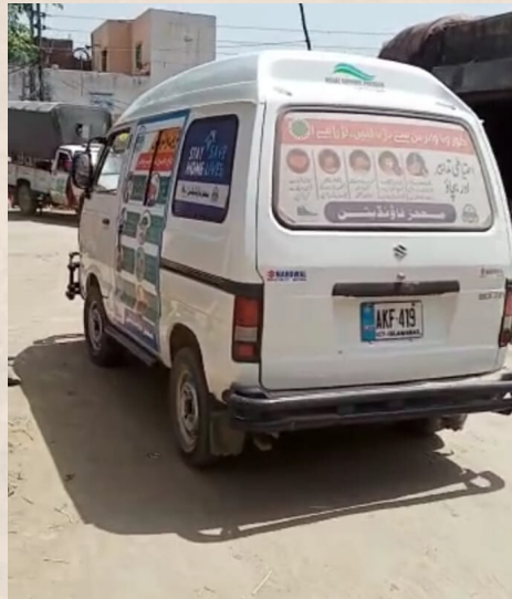
Awareness Raising Van of Mojaz Foundation in Narowal

Mojaz Foundation launched its campaign for distribution of Hygiene Kits by partnering with HUBCO CSR Funds.