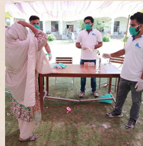
EHSAS Cash counter at Muzaffargarh