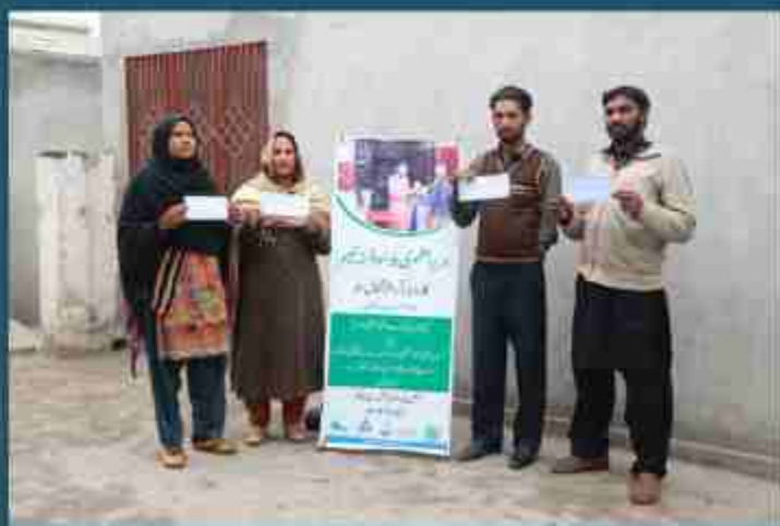
Interest free loan cheques distribution