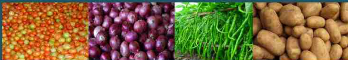
Vegetables produce of the trained farmers