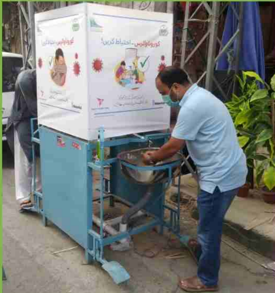
A temporary hand washing station in use by community at public place in Rawalpindi