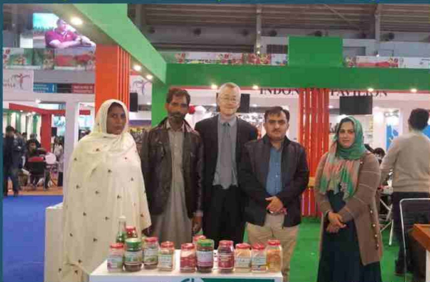
Female farmers posing with delegation during an exhibit of their local produce