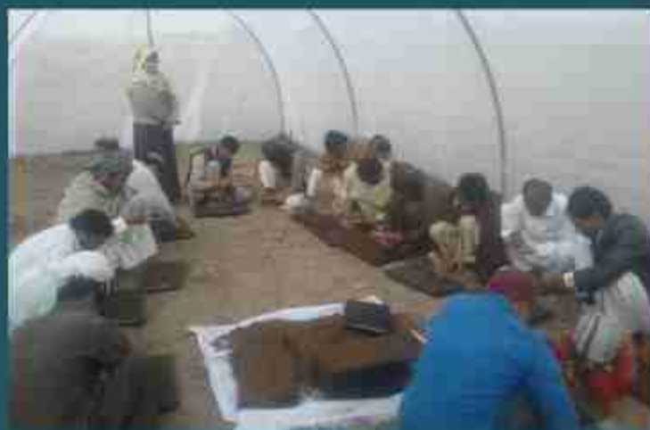
farmers being trained on preparing a sapling dish