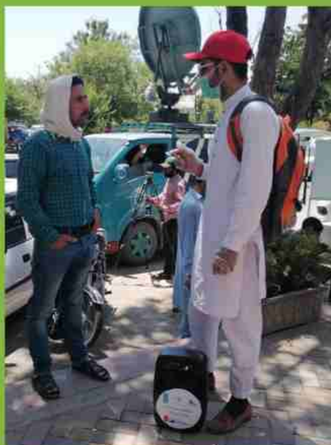
Community resource person delivering session