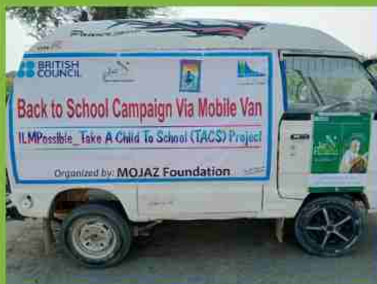
Back to school mobile camp during COVID-19