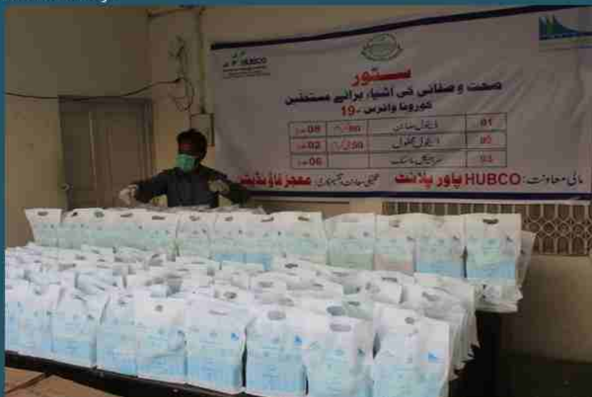
Mojaz team preparing for distribution of hygiene kits during COVID-19 relief

1 (1.5), 2 (2.1 & 2.2), 3 (3.3 & 3d), 5 (5.2), 11 (11.5), 13 (13.1), 16 (16.1)