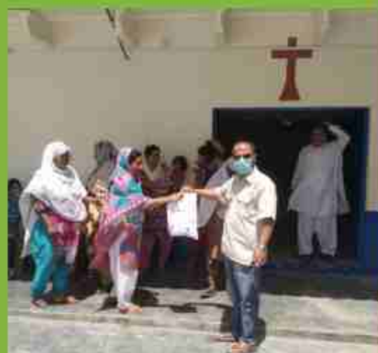
Hygiene kit distribution among minorities