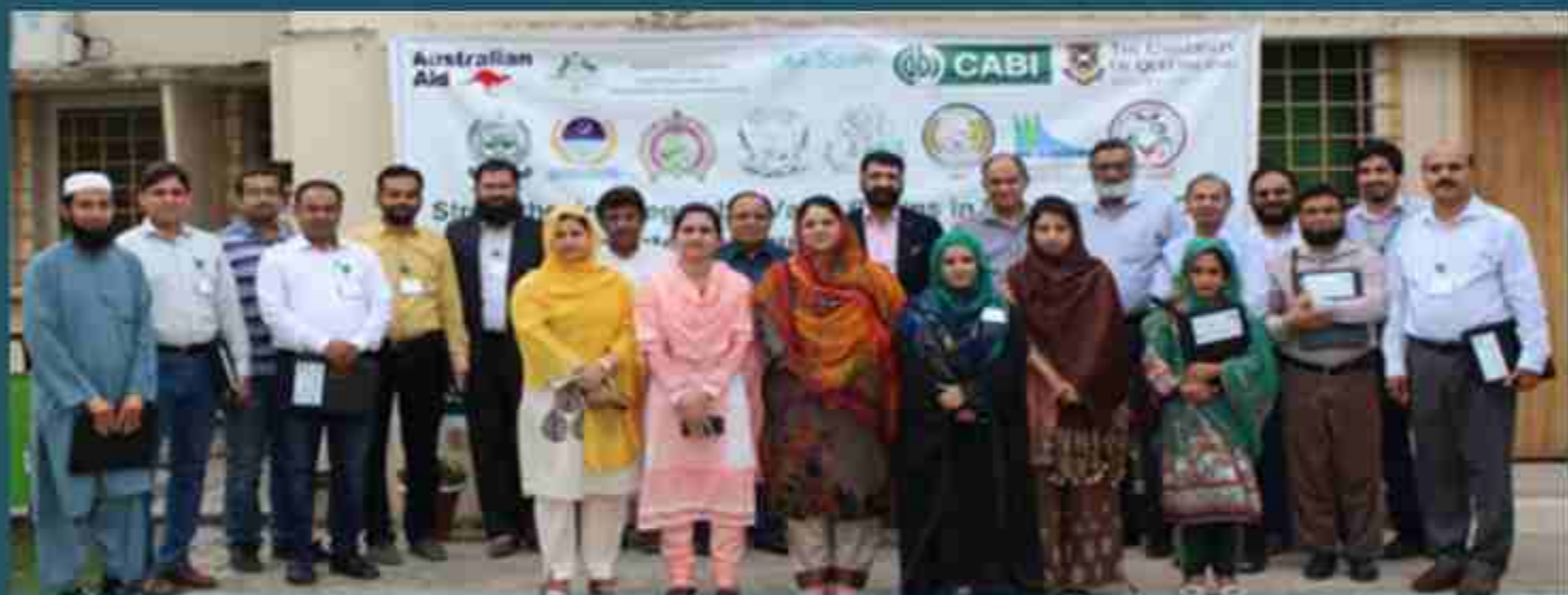
Mojaz team during a value chain training session